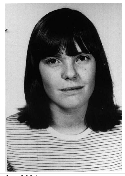
September 2004 Page 55