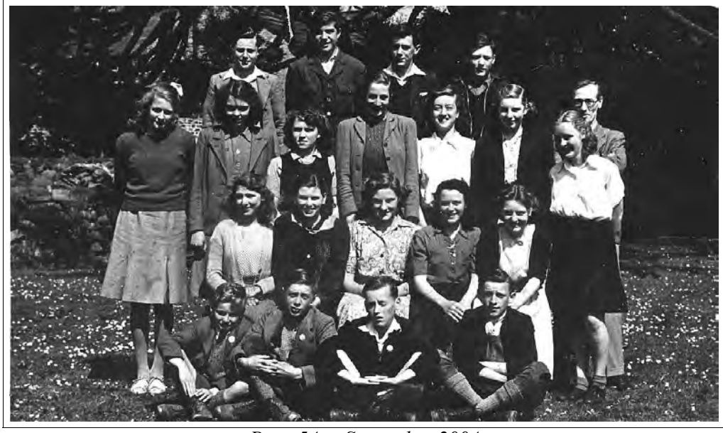
Page 54 September 2004

This month there is one main photo of Settlebeck 1947 which again comes by