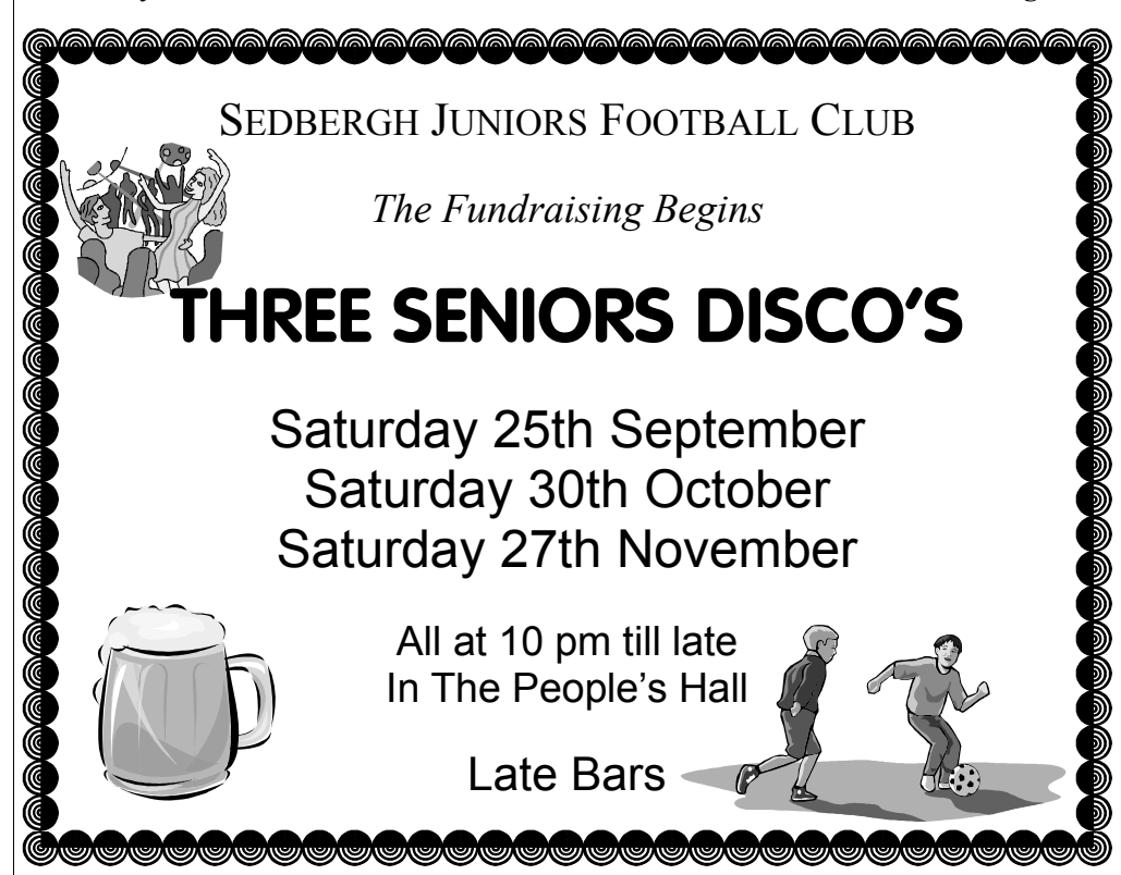
Page 25 September 2004