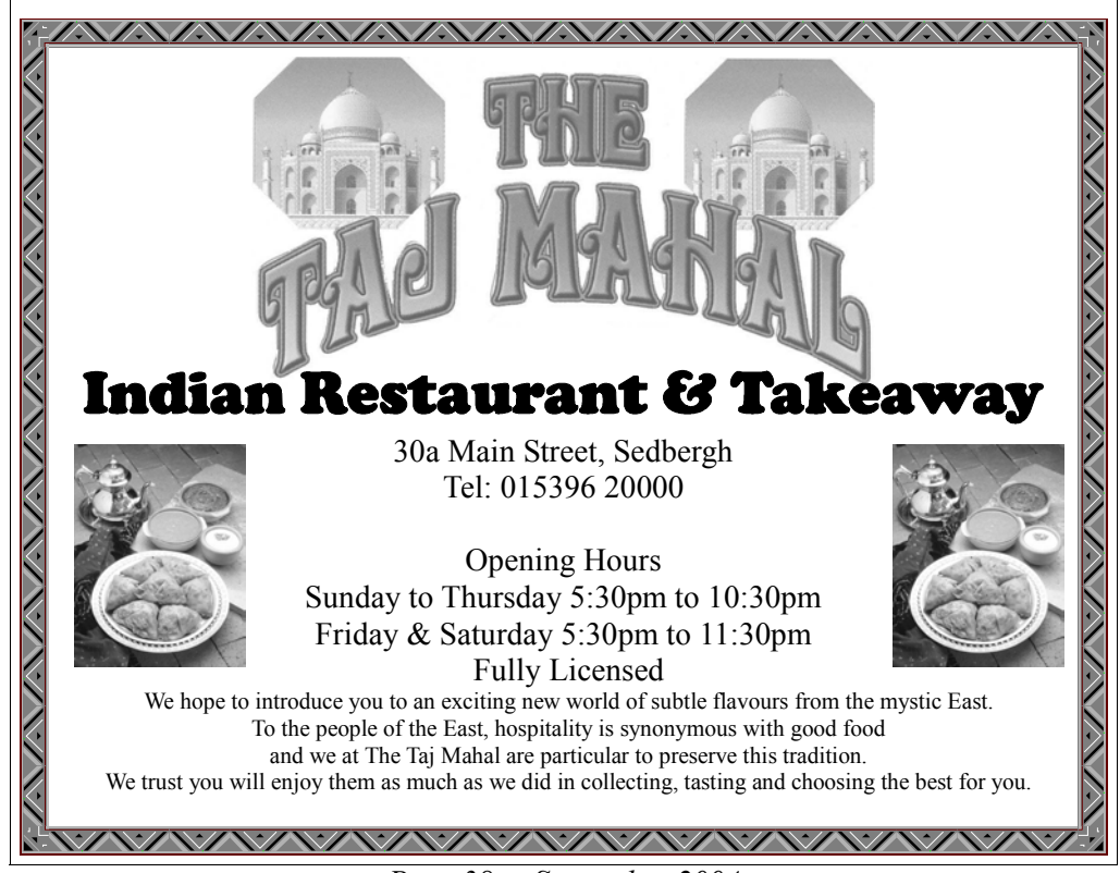
Page 38 September 2004

brought to Cherbourg and shipped to PRISONER OF WAR IN SEDBERGH : England where at first they went into a camp at Oxford, then to Glasgow from which they were embarked for America. After docking in New York they were transported for four days to Arizona where they were put into a prison camp. Alfred got a job working in the canteen at an airfield but also worked picking cotton, as did most of the prisoners. They wore clothes which were marked POW. In 1946 they thought they were being repatriated to Germany but found themselves back in England at Liverpool after a voyage from San Francisco which took them through the Panama Canal. British. After being sent to Edinburgh,