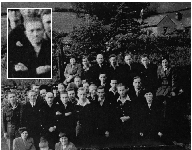
Page 39 September 2004